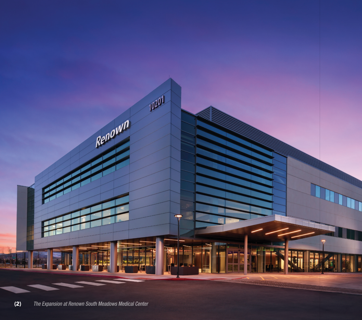
(2) The Expansion at Renown South Meadows Medical Center