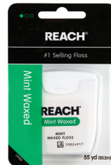
Dental Floss, Reach® Mint Waxed Count: 1