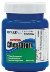
Vapor Rub, 3.5 oz. Count: 1