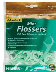
Interdental Flossers Count: 90