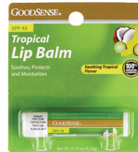
Medicated Lip Balm, 0.15 oz. Count: 1