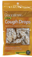
Cough Drops, Honey Lemon Count: 30