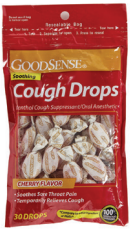
Cough Drops, Cherry Count: 30