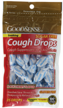
Cough Drops, Sugar-Free, Black Cherry Count: 25