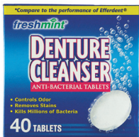
Denture Cleaning Tablets Count: 40